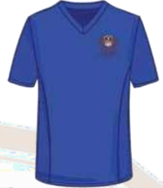
PE Top Blue Year 1 Onwards