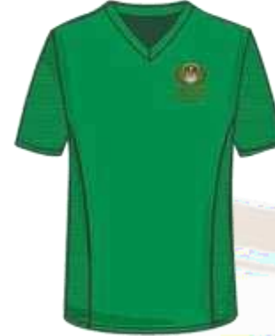
PE Top Green Year 1 Onwards