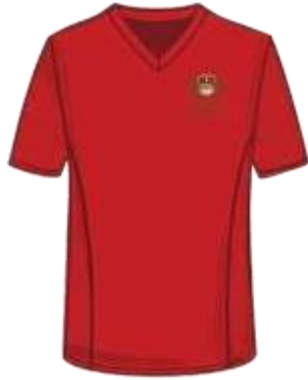
PE Top Red Year 1 Onwards