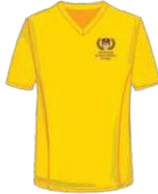
PE Top Yellow Year 1 Onwards