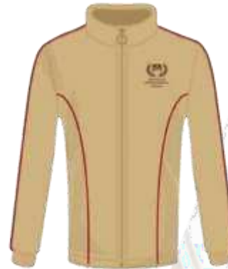
PE Track Jacket